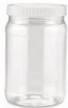
3. Mason Jar or Polyethylene Container